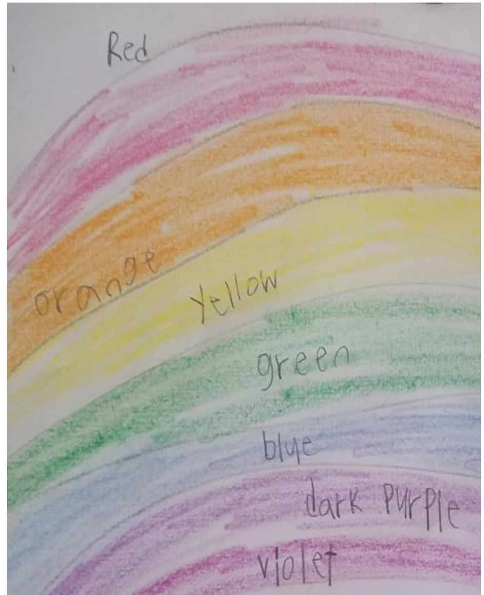
James Rivas Grade 1 \C

I can investigate color theory as I design the correct color sequence a rainbow.